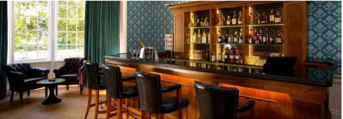
As it is now – the bar of the GreyFriars Hotel