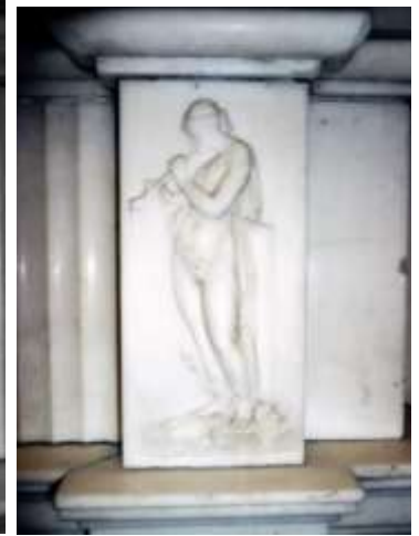
The elegant Georgian fireplace with classical muses, possibly Erato (love song) and Euterpe (music, song, poetry)