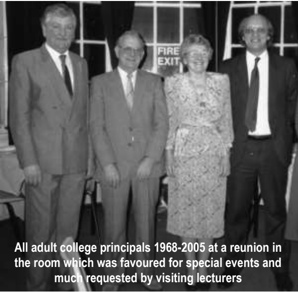
All adult college principals 1968-2005 at a reunion in the room which was favoured for special events and much requested by visiting lecturers