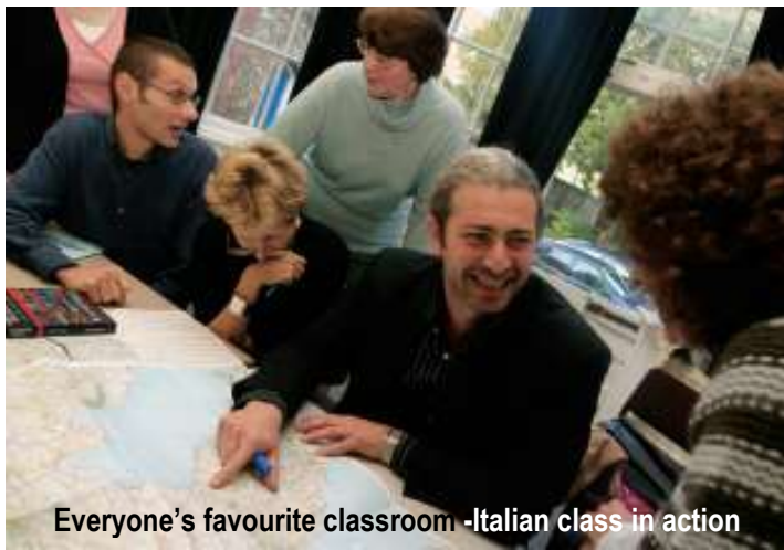
Everyone's favourite classroom -Italian class in action