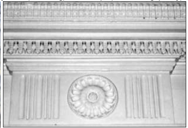
Elaborate door case decoration