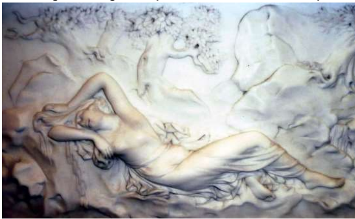
The exquisitely-carved ivory plaque, possibly depicting Ariadne.