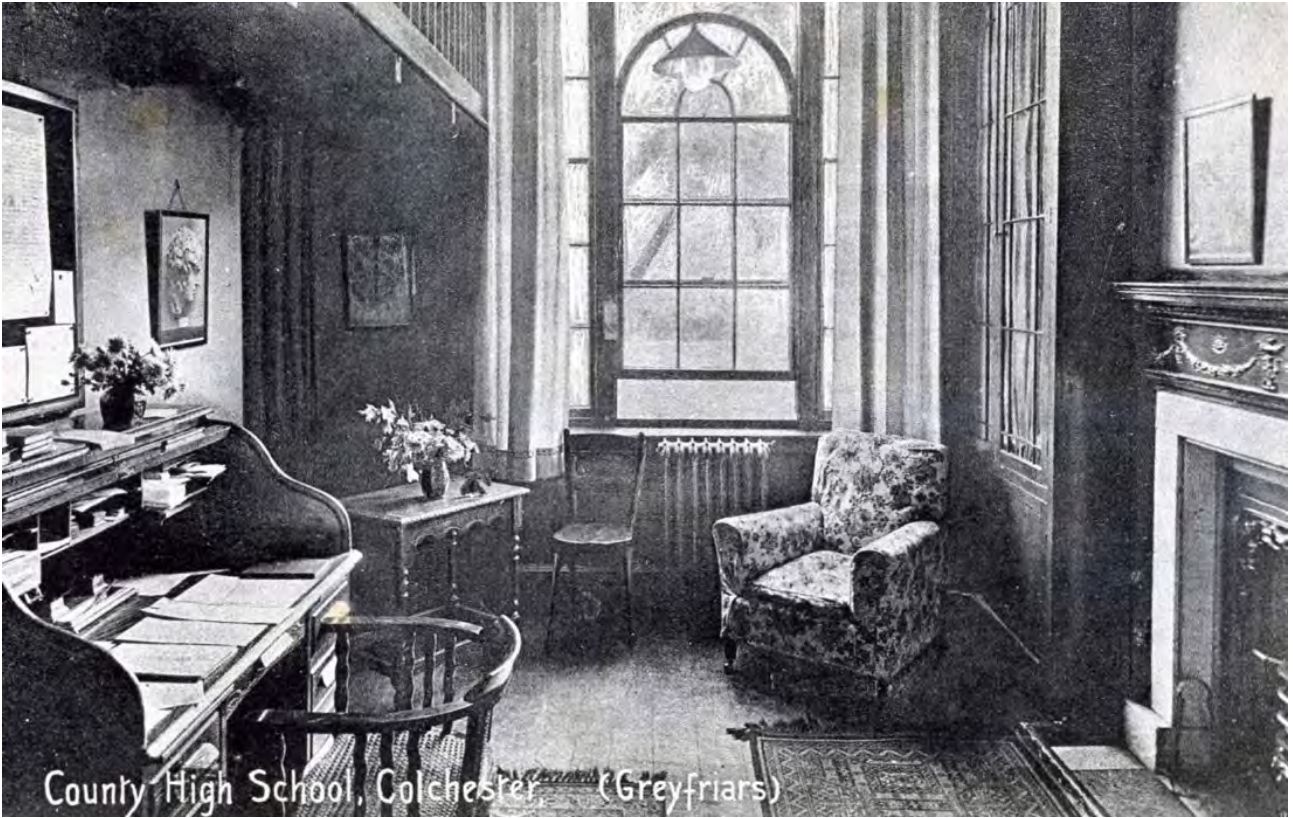
County High School, Colchester (Greyfriars)