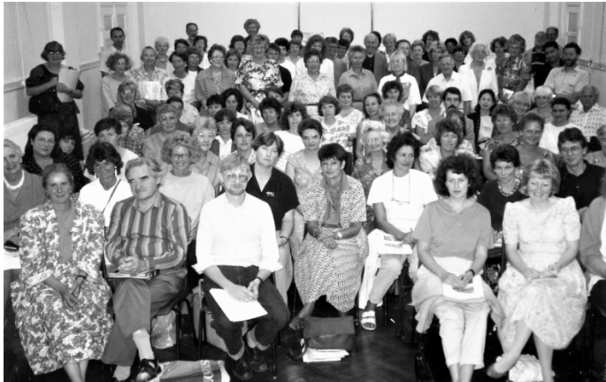
then: Adult Community College Main Hall 1965-2005