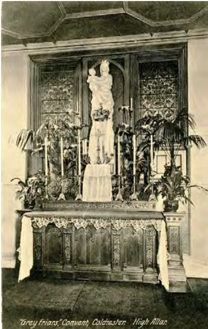
Grey Friars, Convent, Colchester High Altar.