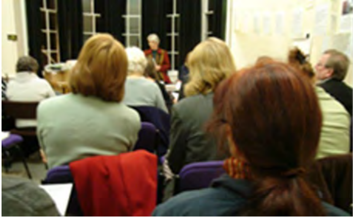
then: Convent School dining room / CCHS classroom / adult college lecture room