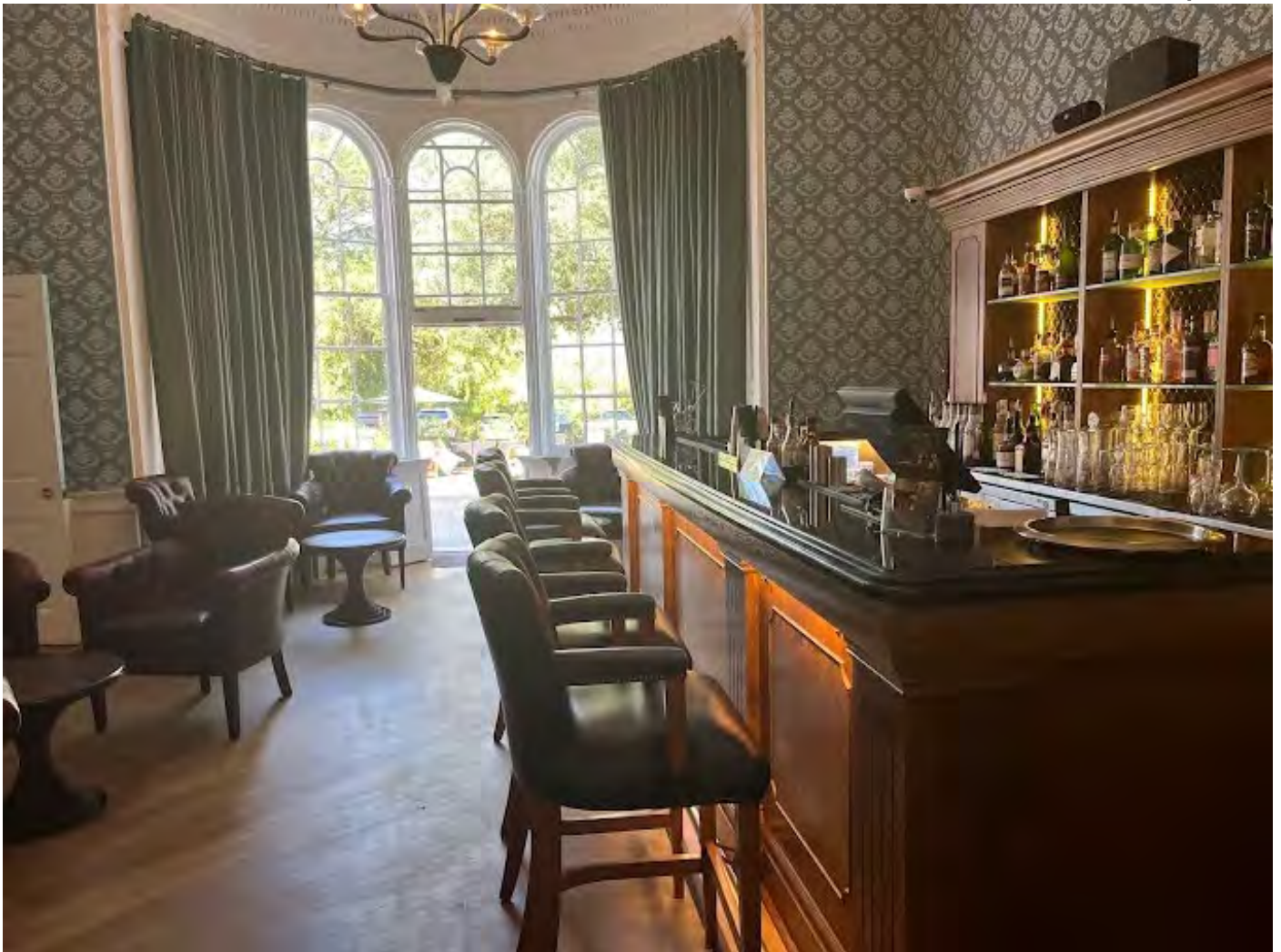
and now: Hotel's Baroque Bar