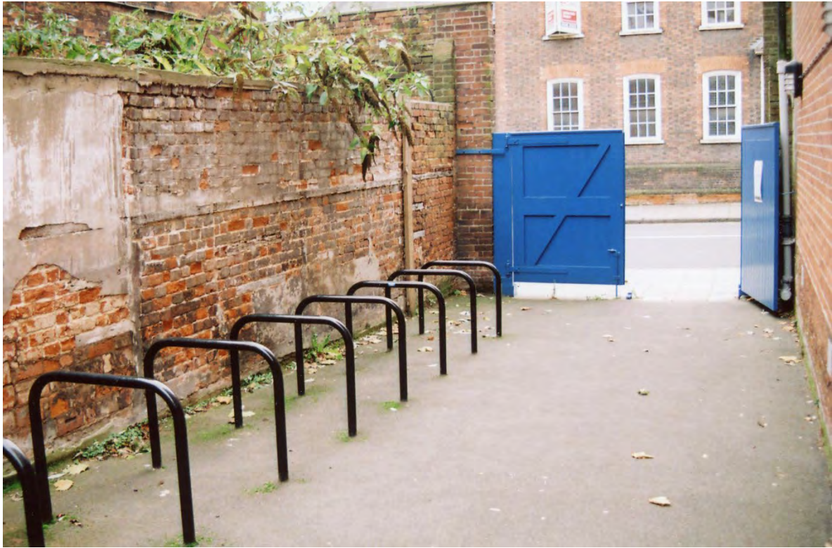
then: Side passage between All Saints & Grey Friars leading to High St.