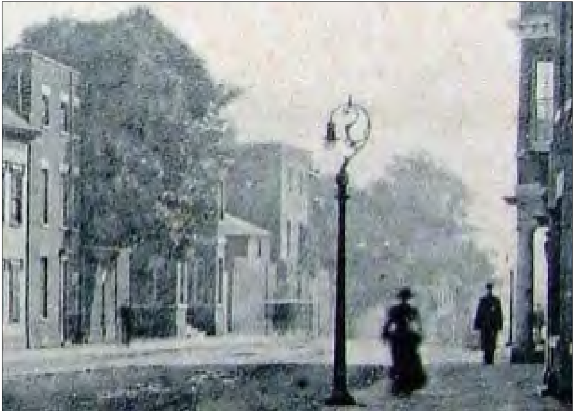
then: 1903 • Hillcrest, Grey Friars & All Saints separated by garden and yard