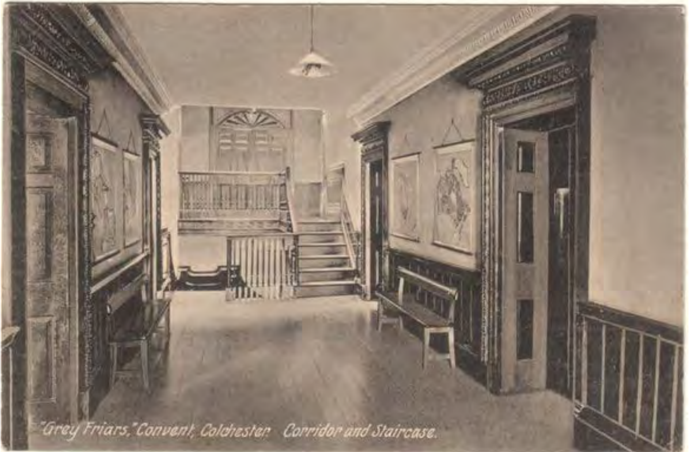
"Grey Friars," Convent, Colchester: Corridor and Staircase.

then: Convent / schools / college first floor landing leading to classrooms and now: Hotel suites access