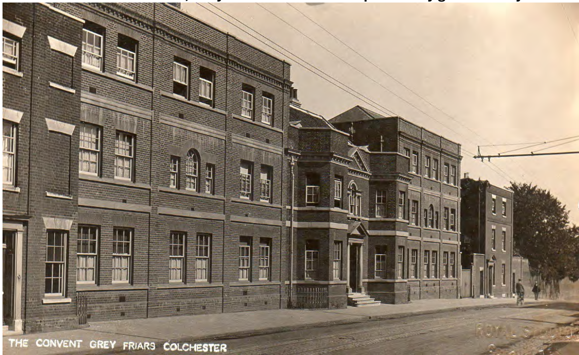
THE CONVENT GREY FRIARS COLCHESTER