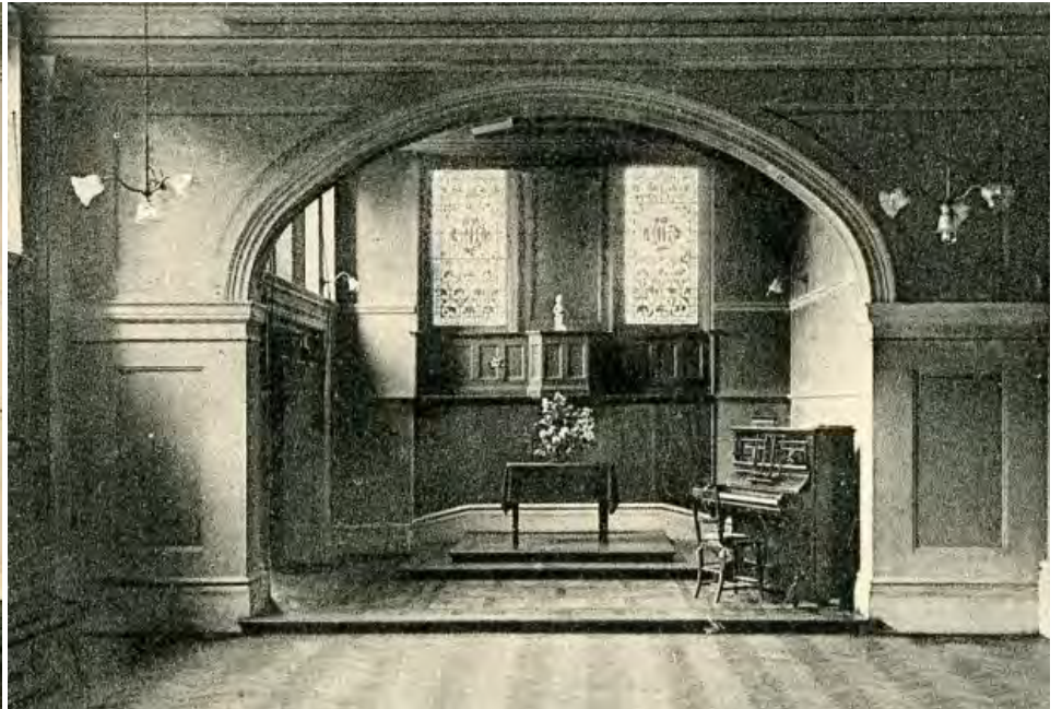
then: 1920-1957 CCHS School Hall & Gymnasium