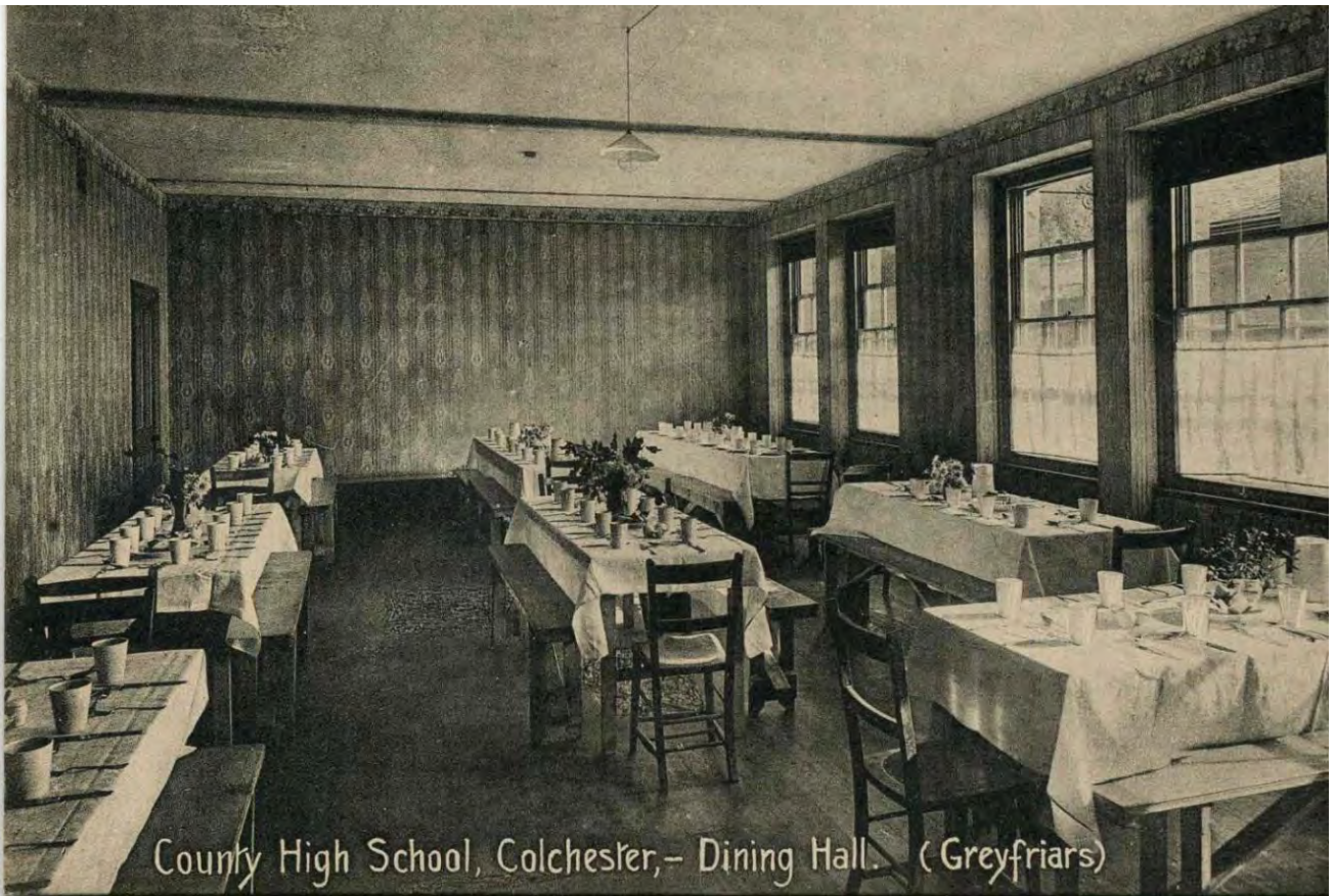
County High School, Colchester, - Dining Hall. (Greyfriars)

then: Colchester County High School dining hall 1920-1957